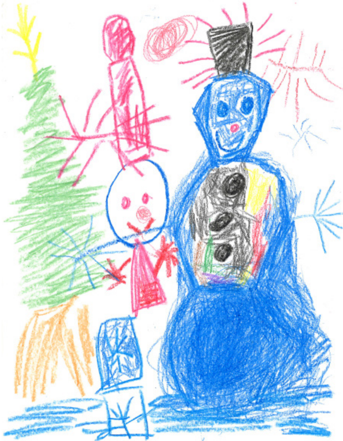
Santa and Snowman Santa talking to the snowman, bring snowflakes.