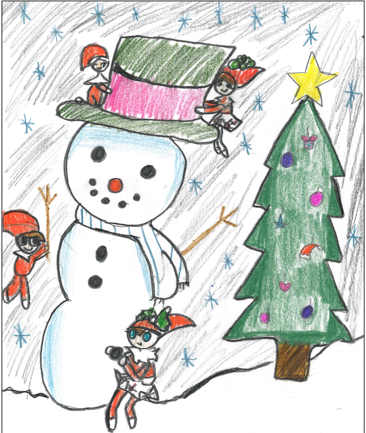
Four elves building a snowman together.